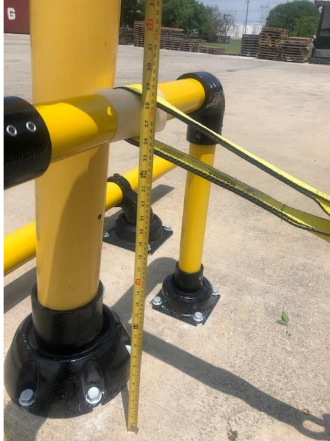
Figure 2 – Pipe Height