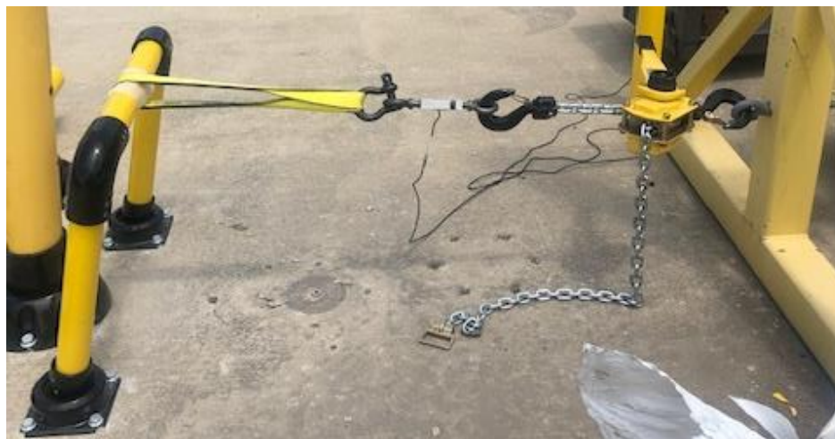
Figure 3 – Horseshoe Rigging