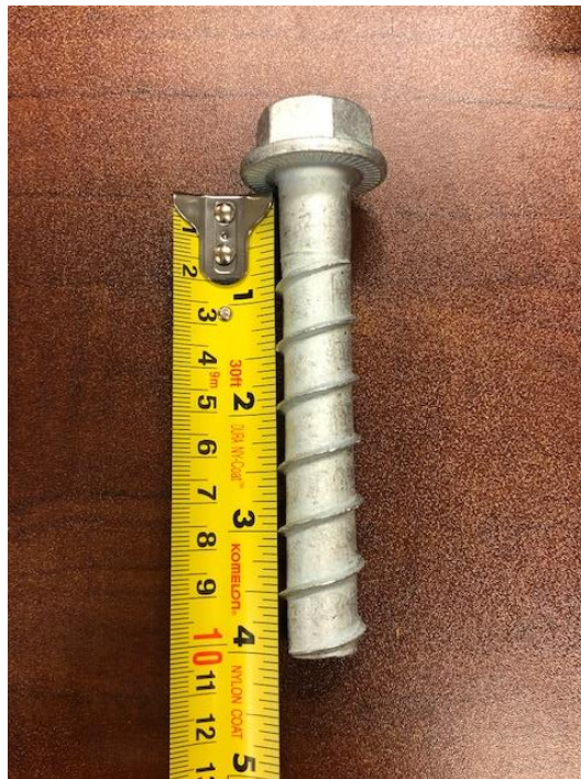
Figure 1 – Anchor Length

Shortened Hilti KH-EZ anchors were used to simulate pull out resistance in 4" residential concrete slab. 5/8" Hilti KH-EZ anchors with a length of 4" were used to anchor the SlowStop 3" IronFlex Horseshoe in the concrete. The SS3Y-27-HS unit has a base plate thickness 1/2", causing each anchor to have a 3.5" embedment in the concrete.