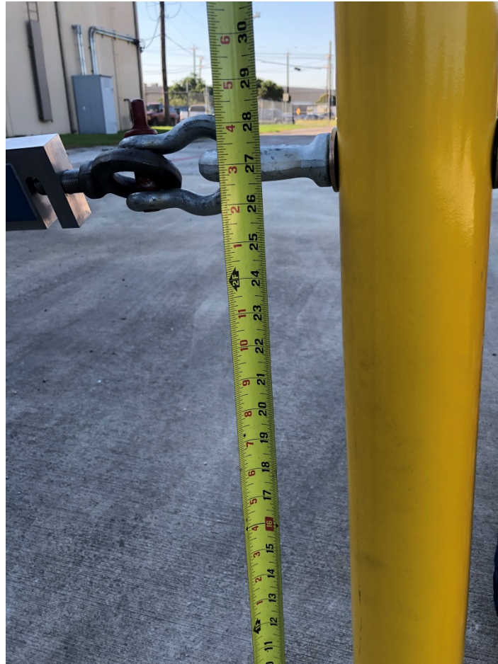
Figure 5 - 27" Above Ground Level Force

Figure 5 shows the location of the connection point to the force applied, confirming 27" above ground. Load applied over the area of the backing washer, obviously less than 12" x 12".