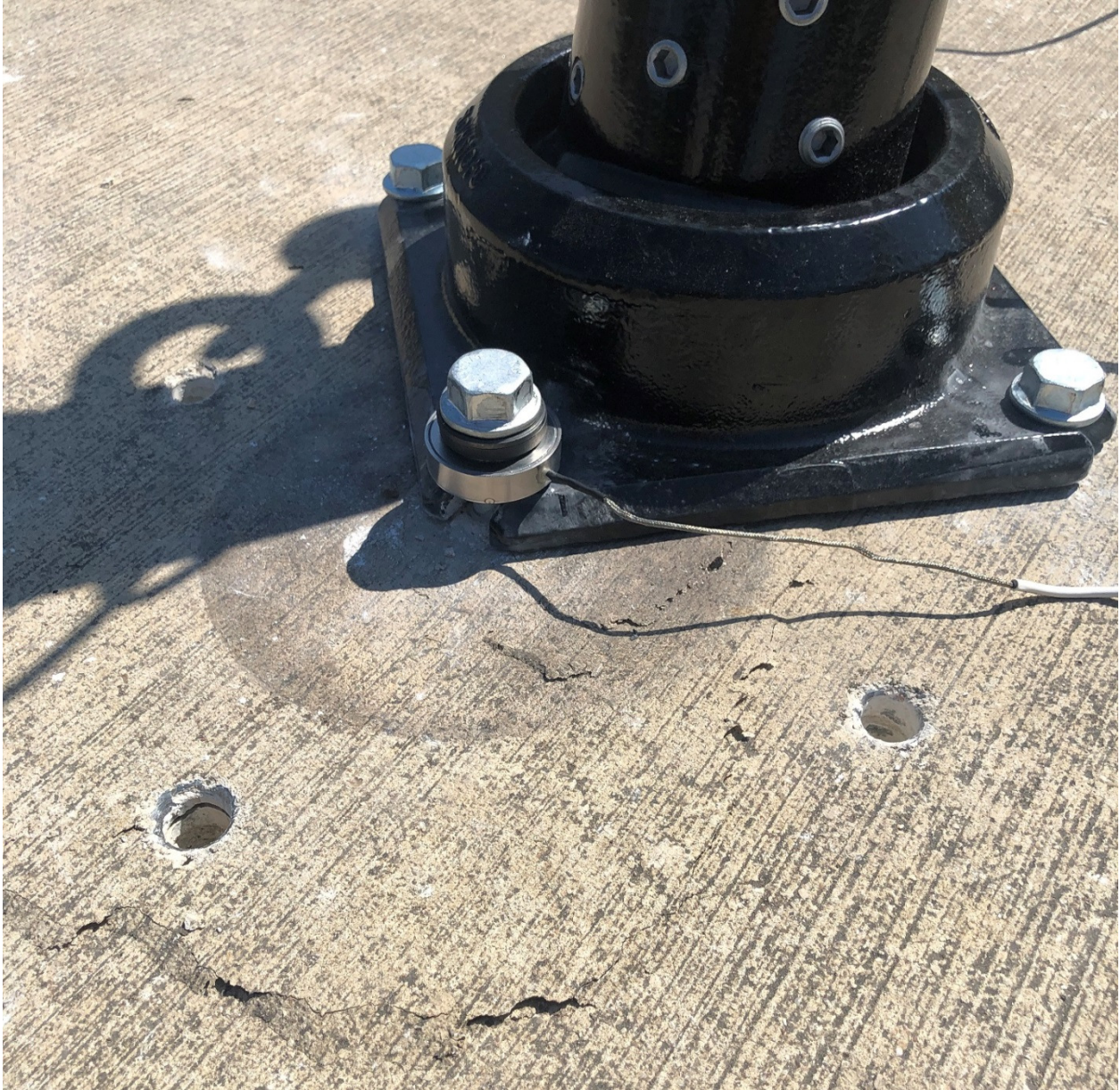
Figure 4 - Spalled Concrete

Because the worst case anchor lost 1" of embedment depth, it is logical to assume that the concrete would have failed later had there been full embedment.