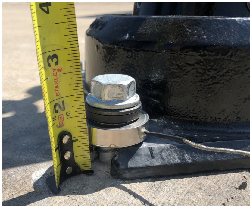
Figure 2 - Loss of Embedment at Load Cell

A 50,000 pound rated washer type load cell was installed under the head of the worst case anchor in order to read actual force exerted upwards by the bollard base onto the head of the anchor. Concrete used was 3,000 psi, 6"-7" thick parking lot grade. This allowed for three of the anchors to be seated fully as normal. The load cell anchor, however, lost a little over 1" of embedment depth due to the measure device and required structural washers. See Figure 2.