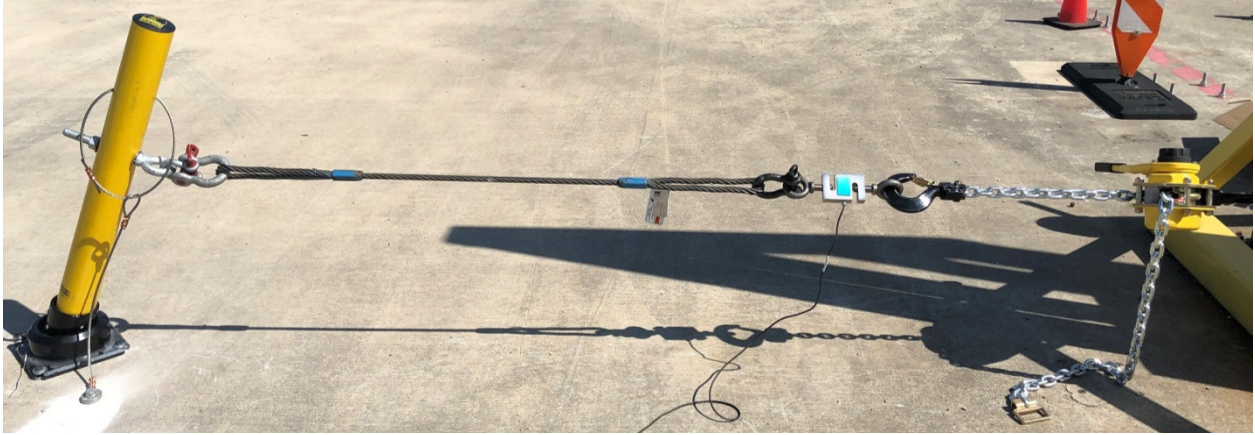
Figure 1 - Bollard at Maximum Force

A production SS4Y-42 SlowStop Bollard was installed in 3000 psi concrete using standard 5/8" x 5-1/2" Hilti HUS anchors. A hole was drilled in the bollard pipe to connect rigging to pull (in effect a push due to the connection point on the opposite side) the bollard with 6,000 pounds of force using a lever chain hoist. An S type load cell was rigged in line with the pulling force in order to measure actual force.